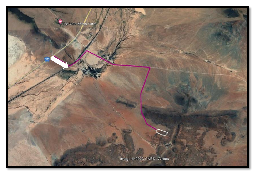
Figure 1: Satellite view showing the access road entrance to the proposed mining area site alternative 1(white polygon) no alternative was identified for this site.