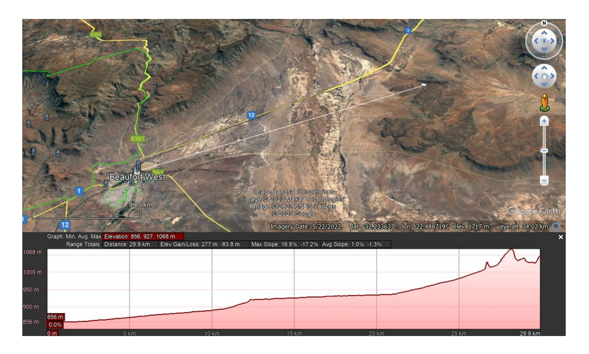
Figure 2: Elevation profile showing the topography between the proposed mining footprint (white line) and the town of Beaufort West. (Image obtained from Google Earth).